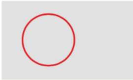
Rear Puller lubricated design

Direct Drive Feed-off-the Arm Machine Mechatronic Wildely Using