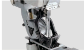
Automatic Needle stopping