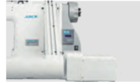
Integrated, Power Saving