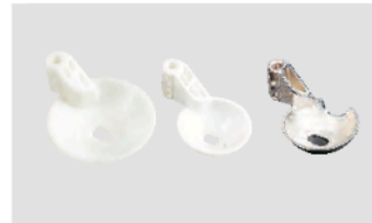
Various Big Presser Foot, Wide Range Of Application