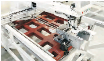
Moving Stable; Low Vibrati

Heavy Base Large-area pattern Sewing Machine Polytechnic; Easy Operation; Stabilization